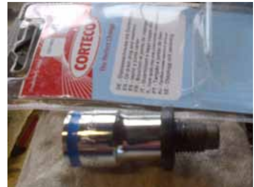
Figure 3 New plug 1/2” drive 1/2” 6 point socket

With the new plug I checked the hex size with several sockets, and guess what? A ½” socket fits much better.