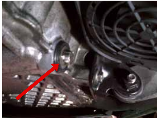
Figure 1 Worn hex and large rubber molded seal on factory plug

Usually Craftsman sockets are decent quality, but this was a concern. As the afternoon was almost gone, it was decided to leave the oil for another week and get better prepared.