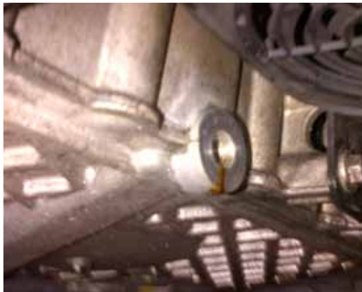
Figure 5 Plug out with no thread damage

Heating on the lower half of the rubber for only about 10 seconds, my normal long ratchet easily took the plug out. Focus the tip of the flame directly on the rubber. So the heat theory is validated.