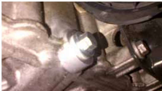
Figure 6 Plug with Aluminum washer

Note that the thread depth of some Honda plugs (also 14mm x 1.5mm thread) is very short, don't use them, many Honda's have stripped thread problems.