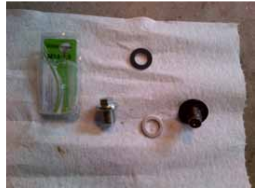
Figure 2 Premium 652306 plug, with fiber and AN washer and factory plug

The aftermarket plug came with a fiber washer, but I felt more comfortable with an aluminum crush washer.