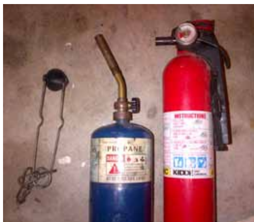
Figure 4 Lighter, propane torch, and fire extinguisher

Be particularly careful that no fuel leaks exist. Have a fire extinguisher close at hand. When under the car, safety glasses or goggles should be worn. When using the propane torch leather gloves should also be worn.