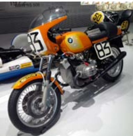
R90S complete with 2 spark plugs per cylinder

In the racing bike section they had one of my favorite bikes, the R90S (circa 1976).