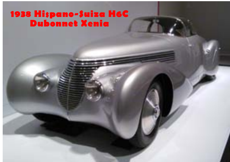
1938 Hispano-Suiza H6C Dubonnet Xenia