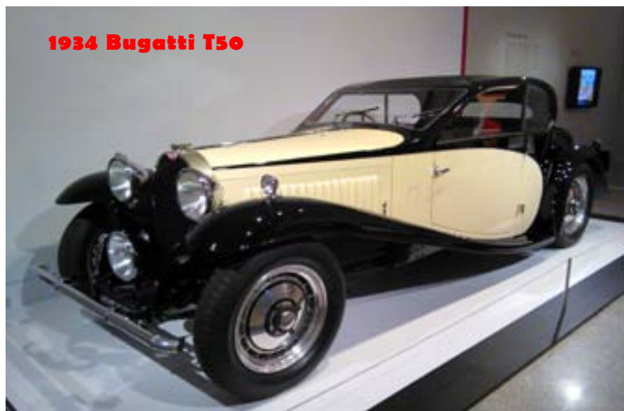
1934 Bugatti T50