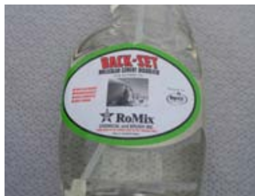
Figure 2 Back-Set cement remover

Some searching on the internet led me to a company called RoMix (www.romixchem.com). They make products claimed to break down cement products. After calling and talking to them they said their product should work, but they only sell to dealers and industrial sizes. They recommended a company that buys from them, Top of the Line in Arkansas, and packages in smaller quantity. They can be found at www.topoftheline.com and