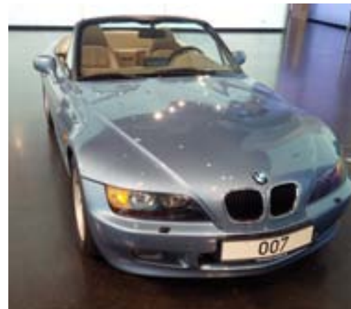
2007 Z3 4-cylinder power