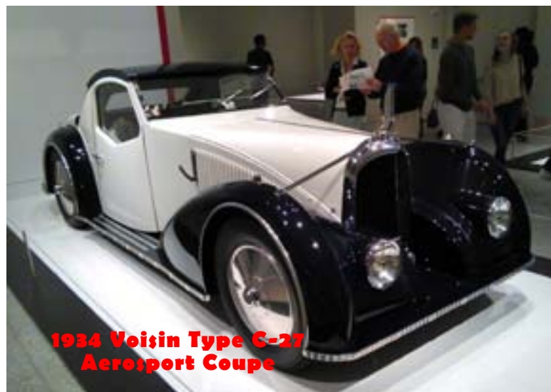
1934 Voisin Type C-27 Aero Sport Coupe