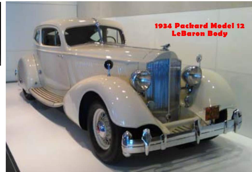
1934 Packard Model 12 LeBaron Body

This was a visual cornucopia for me. Its hard to imagine just how much hard work went into creating every one of these gorgeous machines. Literally most every part was hand made by a metalsmith artisan. These pieces are timeless art. . .