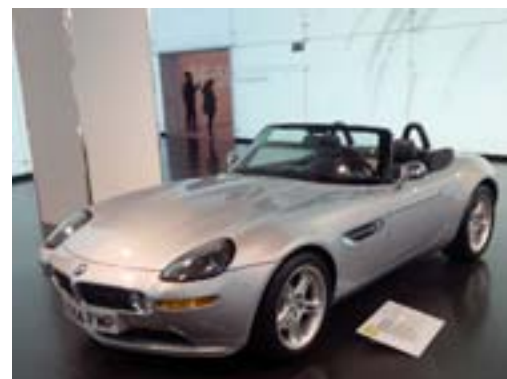
Z8 with V8 power

Next we headed back across the street to the BMW World part. Plenty of new cars, motorcycles, and BMW accessories to look at.