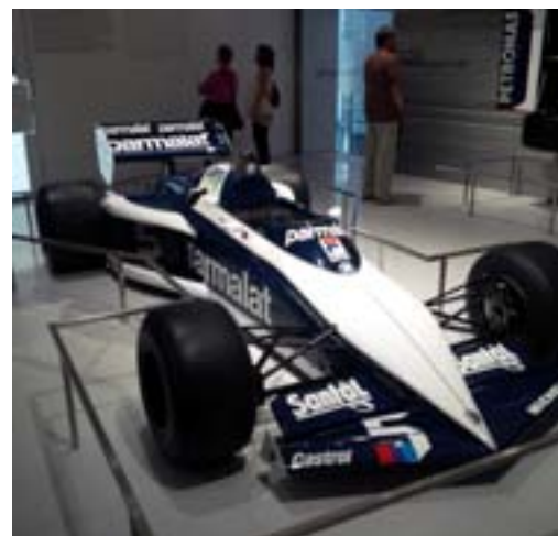
Brabham BT52 with BMW power

The formula one cars were also interesting, maybe someday the F1 rule book will get reasonable again and BMW can join back in. Nelson Piquet won the 1983 Championship in the Brabham BT52 with BMW turbo engine making about 800hp.