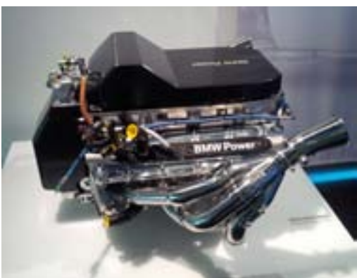
BMW V10 3 liter race engine, 19,000rpm and 925hp

Many race engines are on display, as are regular car engines.