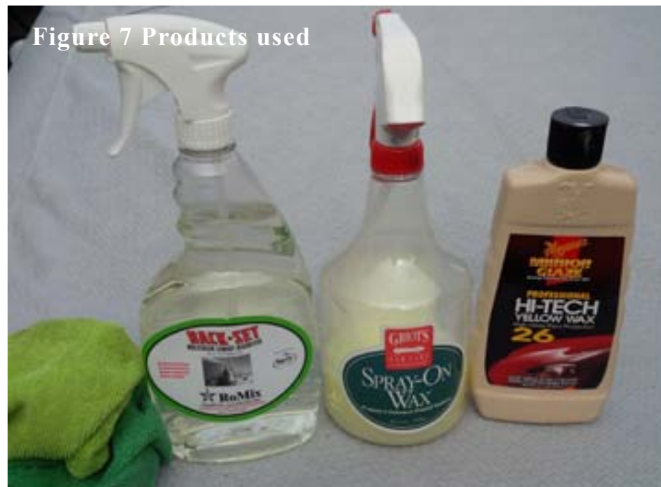
Figure 7 Products used

Using quality products provided the desired result. This job only used a few ounces from the bottle.