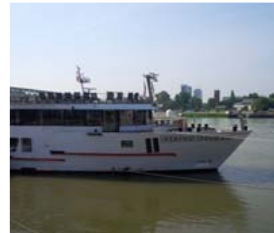
Our ship the Viking Legend

Some sailing is during day and some at night. Our trip made stops in Linz, Melk, Durnstein, and Vienna in Austria. Then we stopped in Bratislava, Slovak Republic.