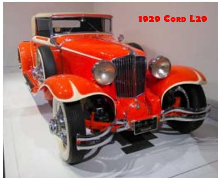
1929 Cord L29