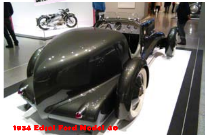
1934 Edsel Ford Model 40

EXHIBITION TICKET SCULPTED IN STEEL: ART DECO AUTOMOBILES AND MOTORCYCLES, 1929-1940 February 21, 2016 - May 30, 2016 This any day, any time ticket is valid for one entry during regular Museum hours. Drop in at your convenience. Entry into the exhibition is available until one hour before the Museum closes. Ticket will be scanned at entry.