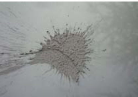
Figure 1 Dried grout on the hood

This is something not expected but of course he couldn't find anyone to take responsibility. At least that's his story. Figure 1 shows worst spot on the hood.