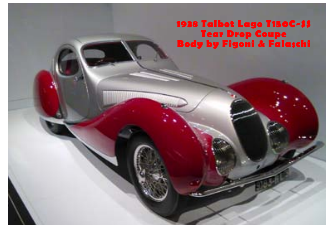
1938 Talbot Lago T150C-SS Tear Drop Coupe Body by Figoni & Falaschi