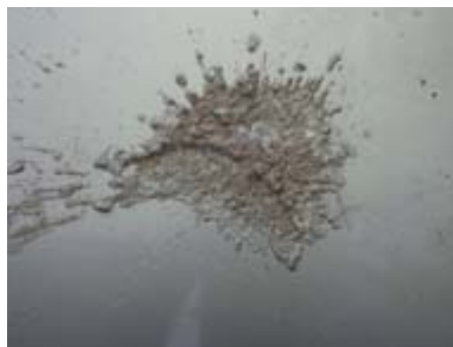
Figure 3 Soaking in

The instructions say not to wet the area, just apply the product on the area. The product then breaks the cement down, and the particles can be hosed off. Figures 3 -5 show the progress.