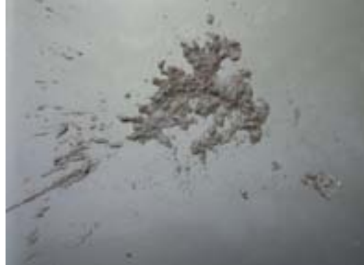
Figure 4 Breaking down

After a few minutes I sprayed some more water, to see if it was working and then spray some more Back-Set.