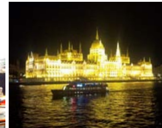
Budapest parliament building at night

Our last stop was Budapest, Hungary. They scheduled a night arrival to Budapest so we were able to enjoy the city lights cruising into to town.