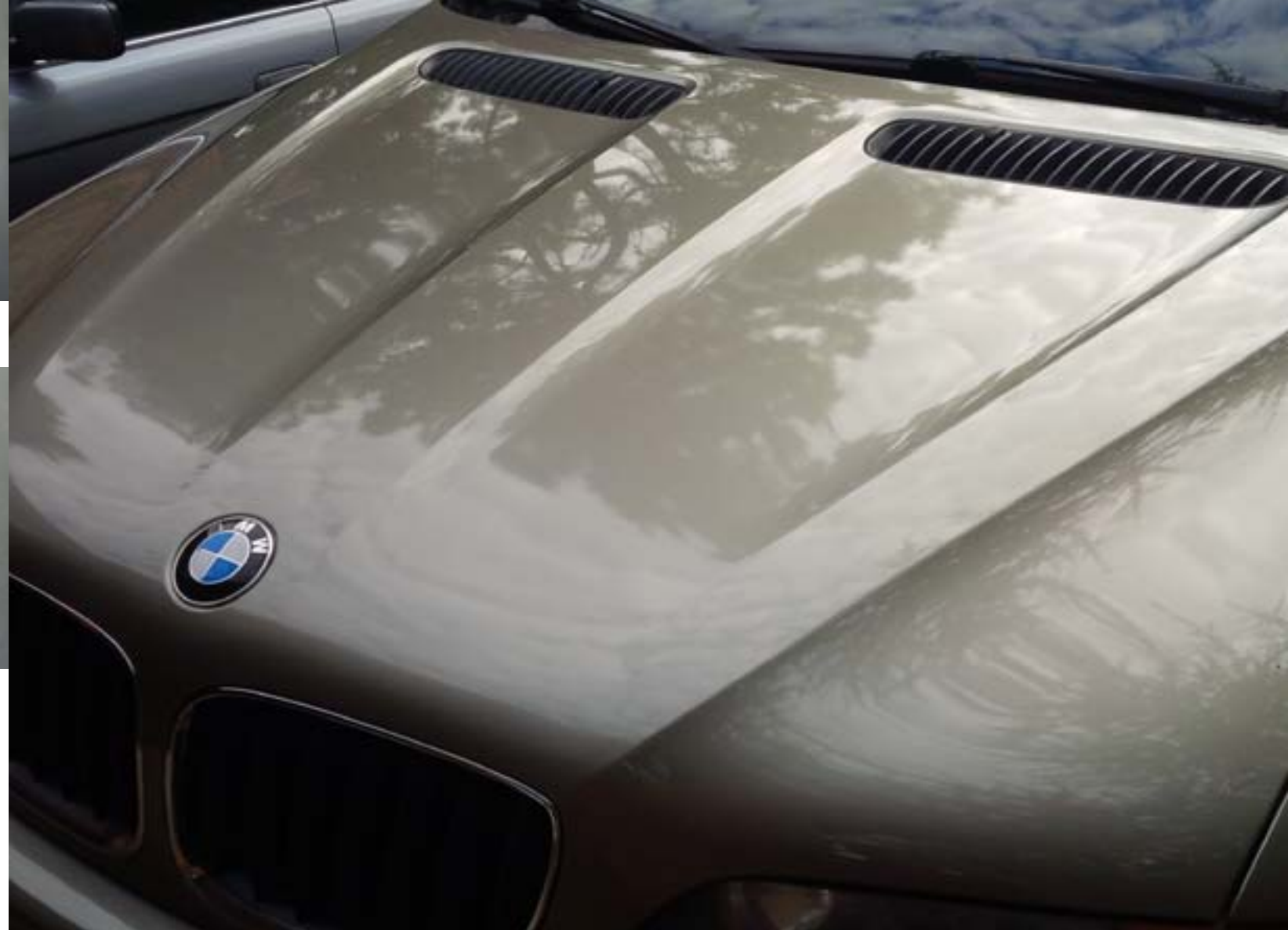
Figure 6 Restored finish

Next I sprayed with Griot's Spray Wax, which prevents water spots, and wiped with a micro fiber towel. Then I applied my normal wax, Meguiar's High Tech Yellow 26, and buffed. Figure 6 shows the result.