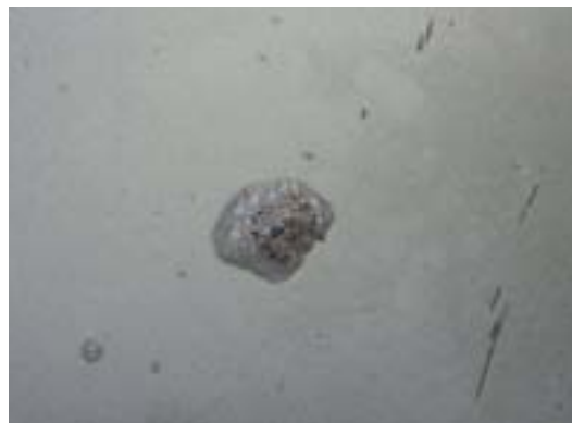
Figure 5 Almost removed

The instruction say a brush can be used. Using a shop towel I blotted the area and the grit just lifted off. Blotting isn't required, and probably better to just let the chemical work, but gave proof it was working. At this point I was very impressed with this product. There were some smaller areas, so more was applied till all were removed, and hosed the hood a final time. By now it was obvious the finish was saved.