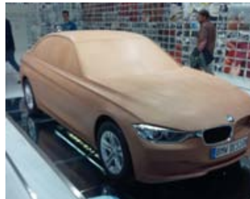
Another interesting display was the clay design car

One display I found very interesting was the trunk badge display. While almost every BMW in the US seems to be badged, the majority of the cars I saw in Europe have no badge.