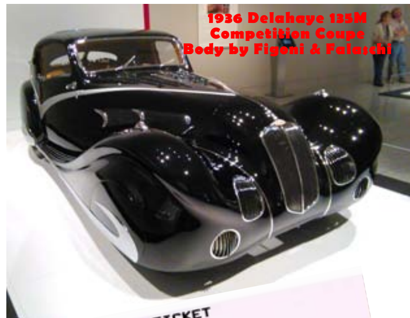
1936 Delahaye 135M Competition Coupe Body by Figoni & Falaschi