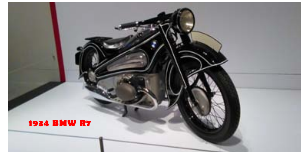
1934 BMW R7