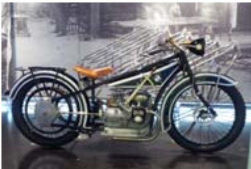
Early BMW Motorcycle

The museum contains many BMW motorcycles as well cars with focus on the early years of BMW and the racing heritage of BMW. I enjoy seeing the motorcycles and believe BMW marketing has long been enhanced from being the only European car manufacturer that also produces motorcycles.